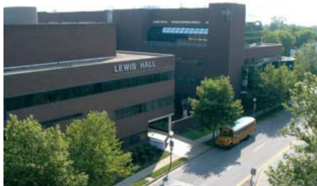
EVMS Norfolk, VA

Objective: Increase Awareness within the legislative community - We will realize this objective by: Establishing Partnerships/Relationships with Public Policy Experts.